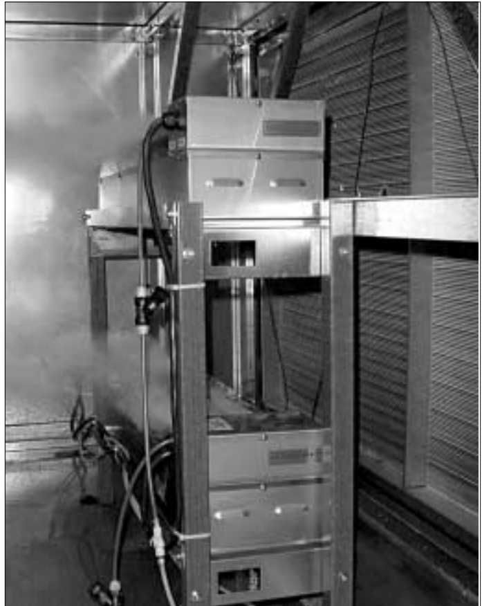
Ultrasonic humidifiers generate a water mist without raising its temperature. An electronic oscillation is converted to a mechanical oscillation using a piezo disk immersed in a reservoir of mineral-free water. The mechanical oscillation is directed at the surface of the water, where at very high frequencies it creates a very fine mist of water droplets. This adiabatic process does not heat the supply water.

White added that while steam systems may have a much lower first cost, end-users need to consider how much it will cost to buy steam canisters. “Every time a steam canister needs to be replaced, it’s necessary to buy it from the original manufacturer. That cost can be $150 to $400 for a steam canister. It makes the first cost look artificially low, because the system is being given away, and money is being made on the parts replacements.”